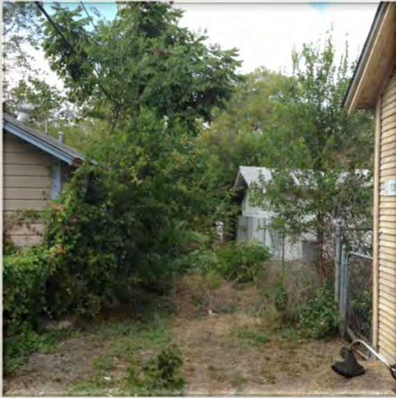
Alley at North/Club BEFORE