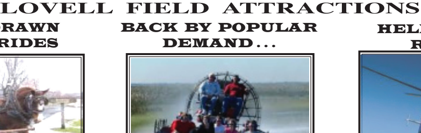
Airboat Rides on the river by the Marathon Fire Department. Fee charged.