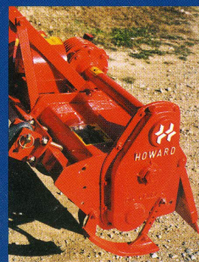
Moveable mounting plate for mounting on any tractor.