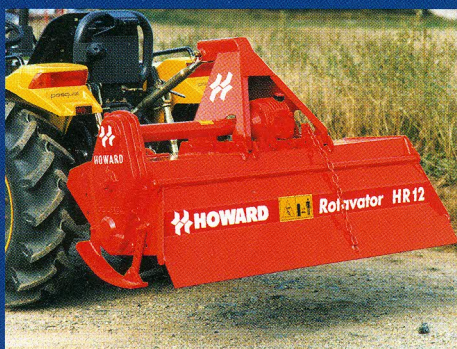
HR 12 model with top mast.