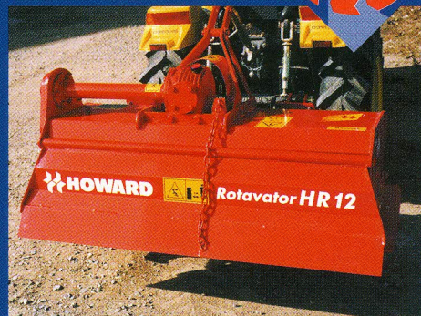
HR 12 model, standard version.