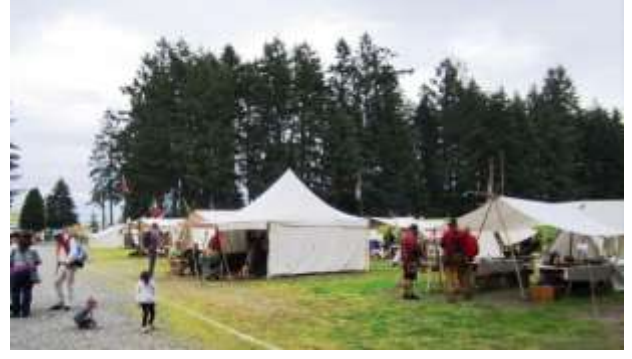
Visiting Trader's Row at the Rendezvous

journey ahead. In the distance we can see the Rockies and it won't be long now before we find some good streams full of beaver. Our traps will be full in no time."