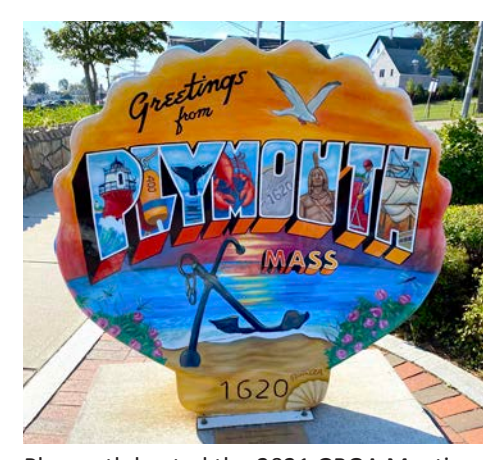
Plymouth hosted the 2021 GBOA Meeting. The next meeting will be held Sept 5 -12, 2022, in Bloomington, Minnesota.