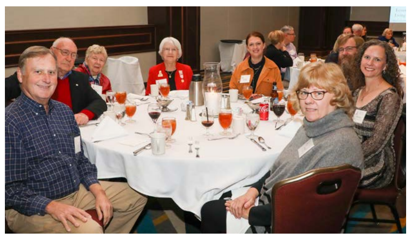
Long-time members share a table with new members at the luncheon.