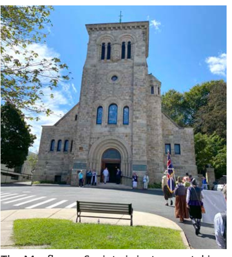
The Mayflower Society is instrumental in restoring the Meetinghouse.