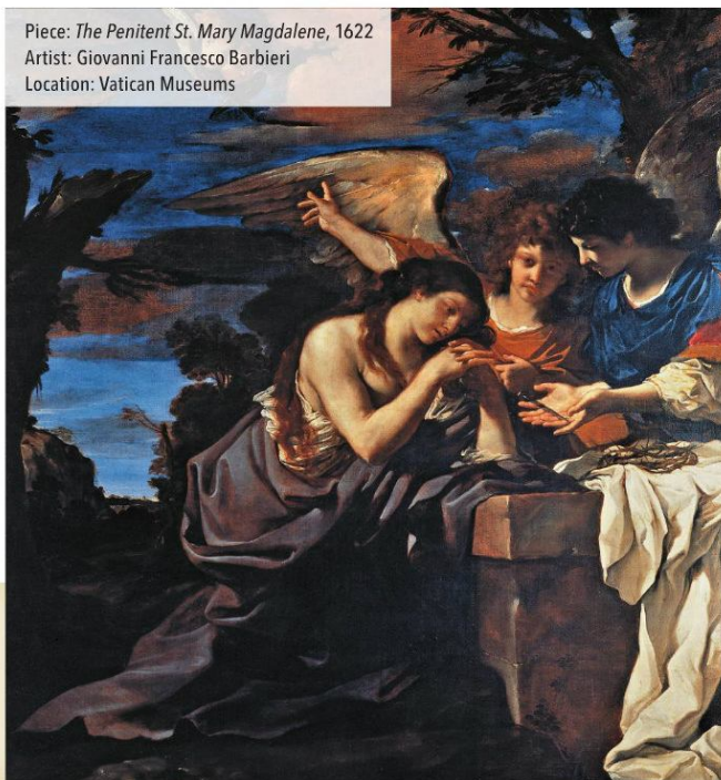
Piece: The Penitent St. Mary Magdalene , 1622 Artist: Giovanni Francesco Barbieri Location: Vatican Museums

His heart was moved with pity for them, for they were like sheep without a shepherd.