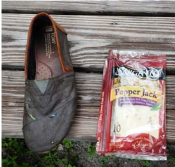
Prize winners: Ugliest item and tastiest item found.