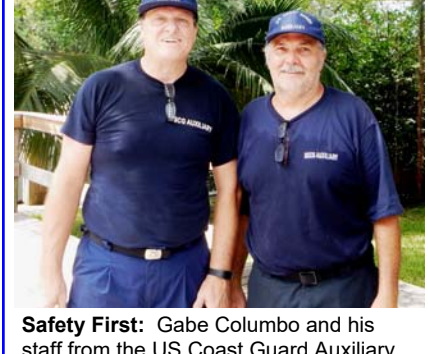
staff from the US Coast Guard Auxiliary provided free Vessel Safety Inspections for all the boaters.