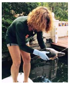
Prize winner: Best wildlife found. Taken home for soup.