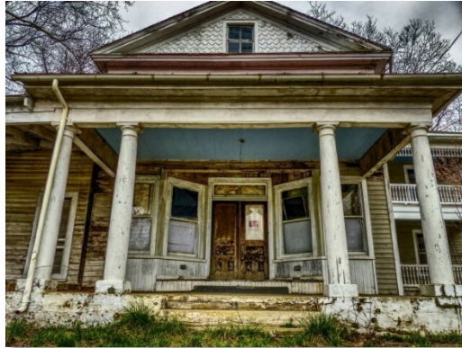
Purvis Store - Current State

PROJECT DESCRIPTION: For many years Purvis Store was the hub of activity in the Historic Village of Esmont (the Village). Built in the early 1900s, it is listed on the National Register of Historic Places as a Contributing Resource to the Southern Albemarle Rural Historic District.