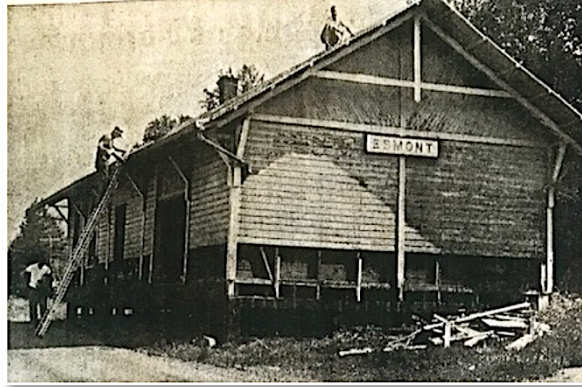
Esmont Depot Being Dismantled, 1964

PROJECT DESCRIPTION: The original Depot in the Historic Village of Esmont, (the village), was removed when the railroad tracks were taken up in 1964, taking the Village name signs with it. The Village lost a major part of its identity when it was abandoned by the C&O Railroad.