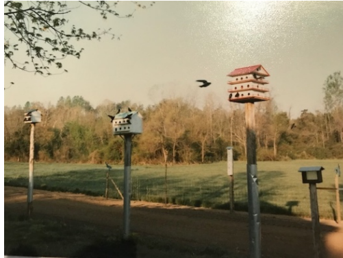
Esmont Purple Martin Houses

PROJECT DESCRIPTION: Ballinger Creek runs through the historic Village of Esmont, (the Village), mostly in an area that is a flood plain, creating a situation ideal for a Wildlife Refuge.