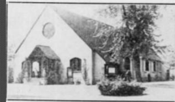
Grant Avenue Presbyterian

First service at Grant Ave. Presbytery Church is held on June 6, 1927 & on April 22, 1930 Grant Ave. was recognized as a Church within the Presbytery of Elizabeth becoming independent of Crescent Ave