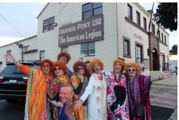
The Mrs. Roper Romp came to Post 132 on March 2