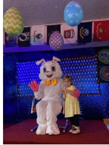
Kids Easter Party