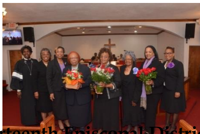
Thirteenth Episcopal District

To God be the glory for all God has allowed us to do and especially for the growth we have witnessed. And the work is still All Divine.