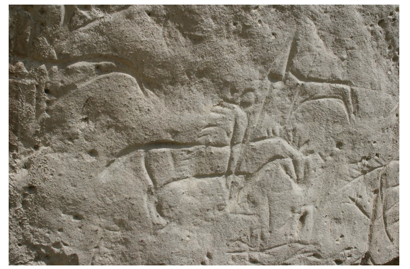
Top: Pine Canyon petroglyph panel depicting a combat scene. Illustration by James D. Kewer

Middle: Battle scene at the White Mountain petroglyph site. Illustration by James D. Keyser.