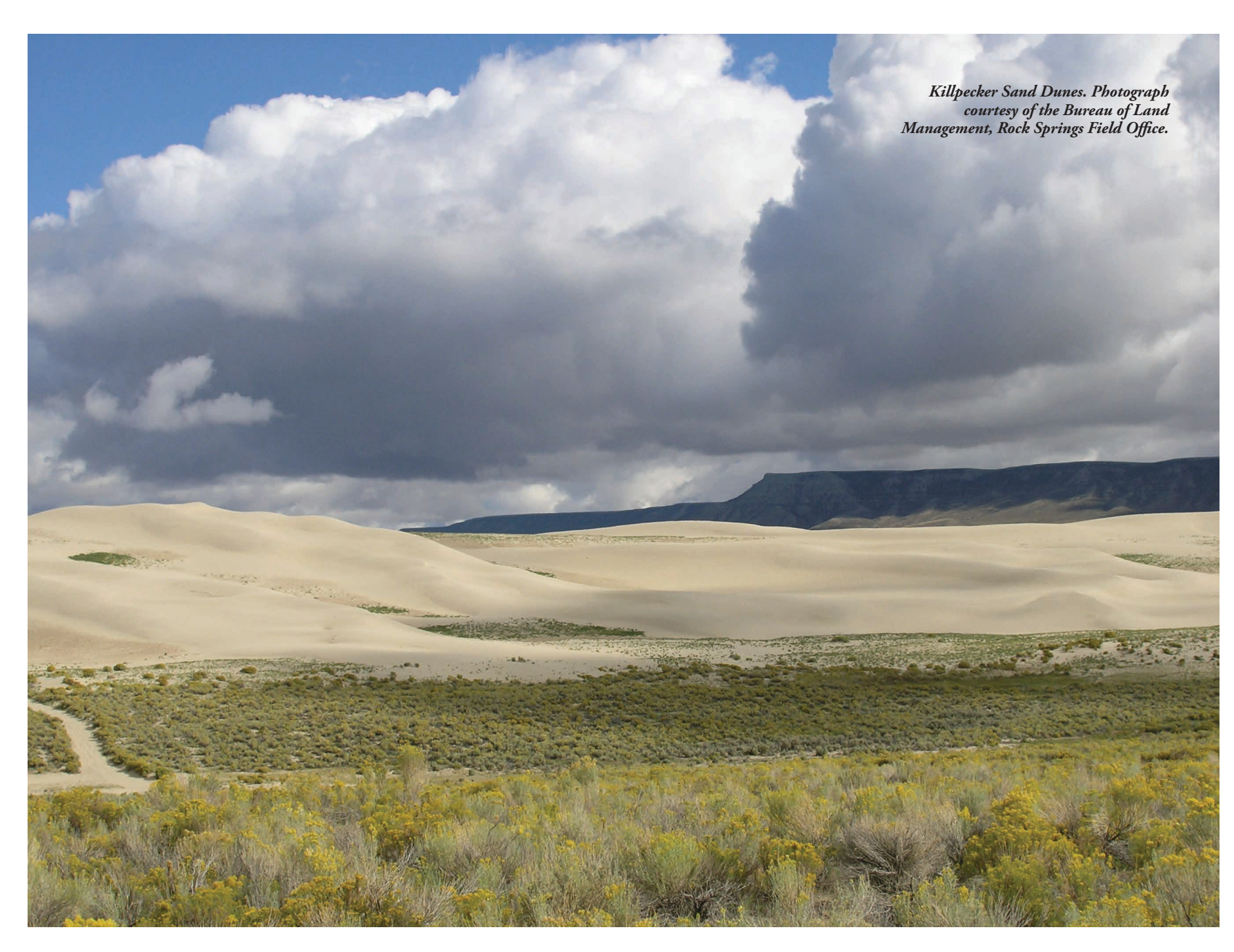
The intervening landscapes which link these lands in question are a complex of interrelated and essential places of religious and cultural significance to our people. All of the lands and elements of the environment within the landscape are related.

—Betsy Chapoose, spokesperson for the Ute Tribe of the Uintah and Ouray Reservation.