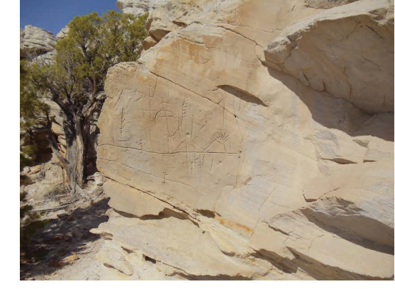
Cedar Canyon petroglyph site.

earlier. Healed broken bones, highly worn teeth, and evidence of respiratory ailments are very common on the skeletal remains of these people. A statistical analysis of the numbers and conditions of human remains found in the surrounding area have lead this researcher to hypothesize that the region served as a sanctuary for elderly individuals relying on the unique resources around the dunal ponds within the shifting sand dunes.