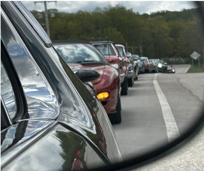
Cars lined up at Hale Museum