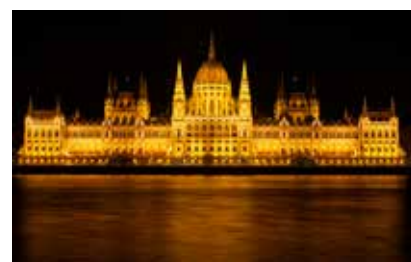
Budapest Parliament Building