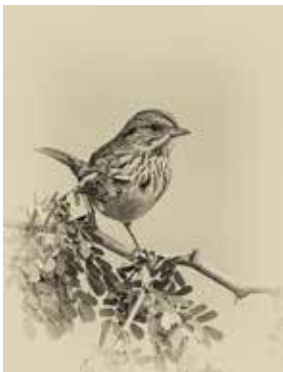
Lincoln's Sparrow