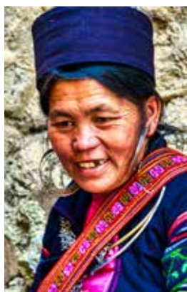
Black Hmong Tribal Woman, SaPa Vietnam Matti Jaffe