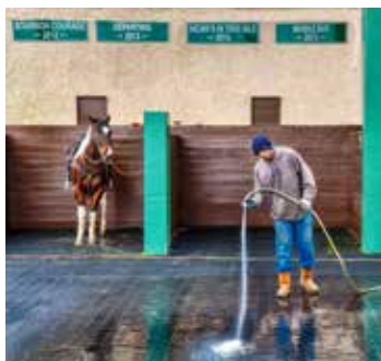
Louisiana Downs Beverly Lyle