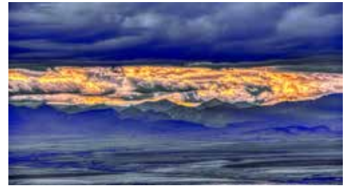
Blue Hour, East Glacier NP, MT Matti Jaffe