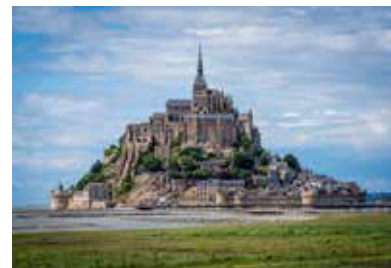
Mont St Michelle, Normandy