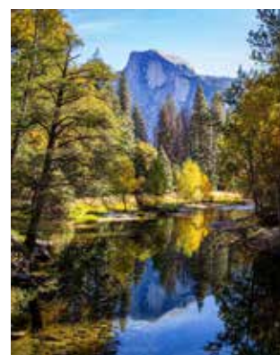
Yosemite Reflections Linda Youngblood