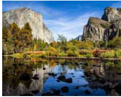
Yosemite View Linda Youngblood