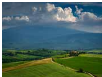
Tuscan Storm Clouds Rose Epps