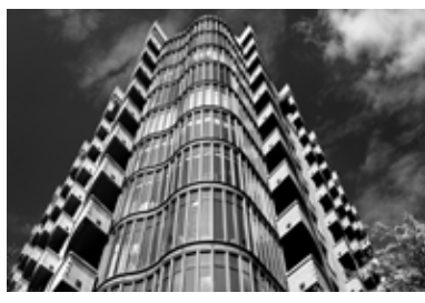
Alien Spacecraft Lands in DC