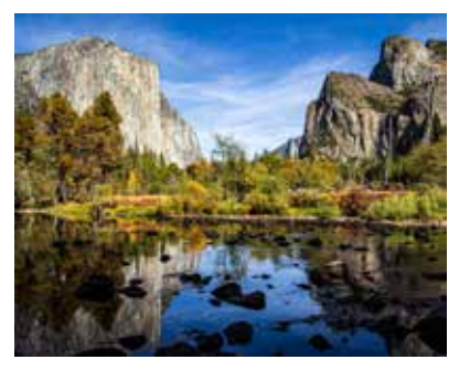
Yosemite View Linda Youngblood