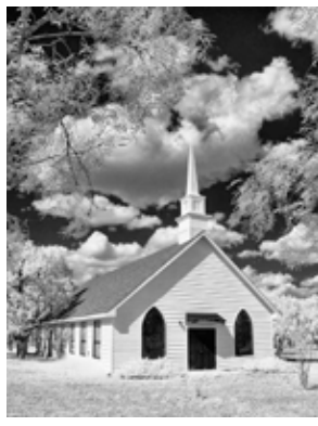
Old Country Church Stennis Shotts