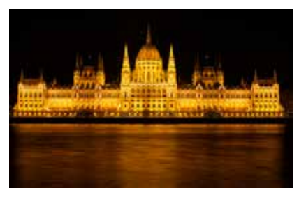
Budapest Parliment Building John Menefee