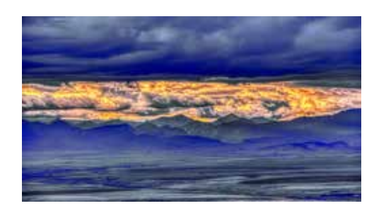
Blue Hour, East Glacier NP, MT Matti Jaffe