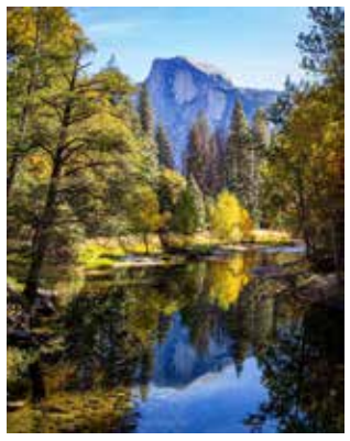
Yosemite Reflections Linda Youngblood