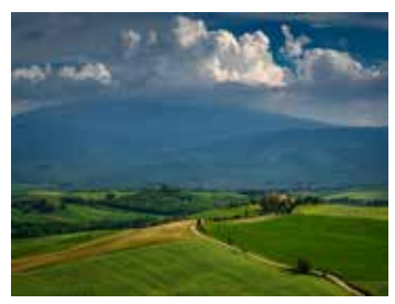
Tuscan Storm Clouds Rose Epps