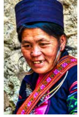
Black Hmong Tribal Woman, SaPa Vietnam Matti Jaffe