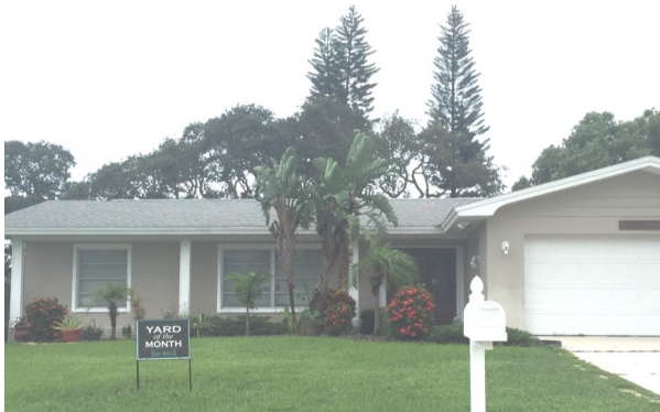
Another good looking home for September Yard of the Month up on Beechdale Court