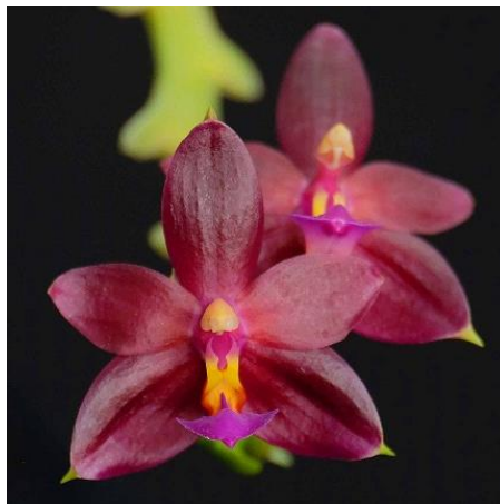
Phalaenopsis Valentinii 'Louisiana'