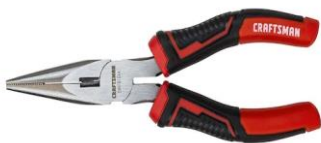
needle nosed pliers