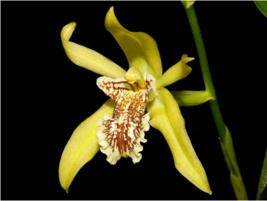
Coelogyne marthae

March 25-27, 2022, Calcasieu Orchid Society Show and Sale Historic City Hall down Lake Charles.