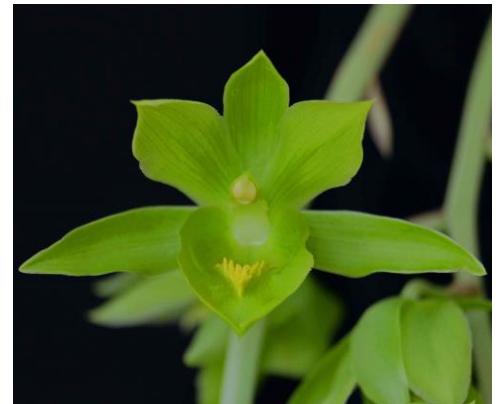
Clowesetum Black Jade 'Antkaren'