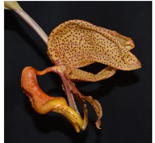
Coryhopea Hayden Dallas 'Pterodactyl'