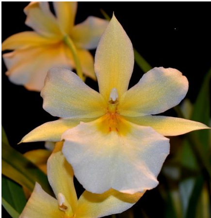
Miltoniopsis roezlii var. xanthina 'Buzz'

NOTES FROM OUR JUDGING CENTERS: We are very lucky to be within a 5-to-6-hour drive to a judging center. Visitors are welcome and bring your best plant for judging.