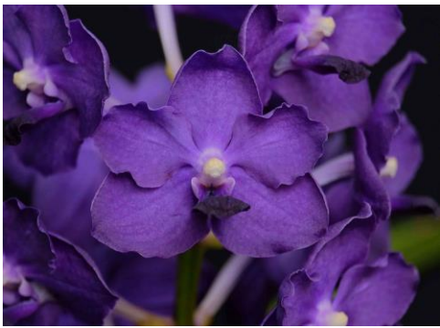
Vanda Phoenpit 'Anna Claire'