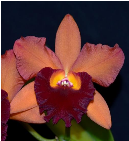
Rth Dragon's Fire 'Aurora'