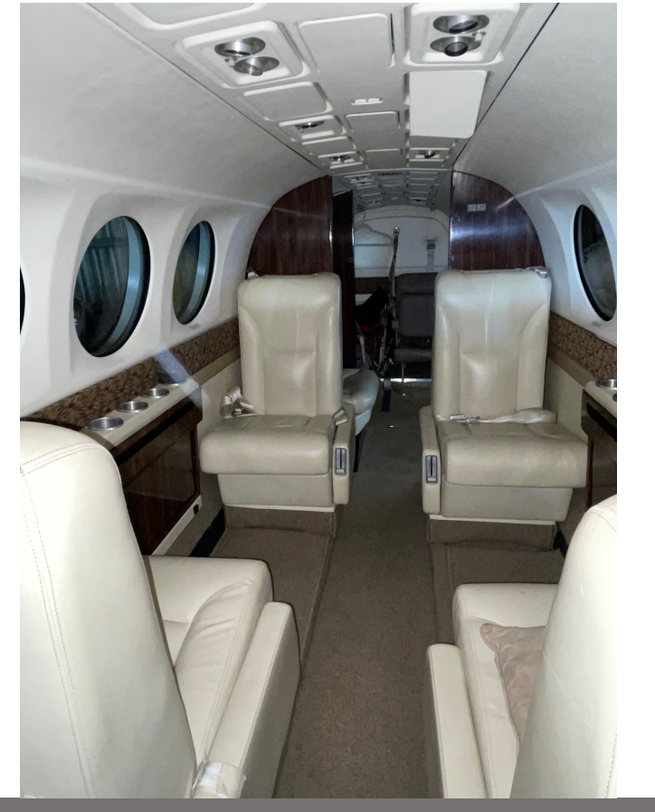
THESE SPECIFICATIONS ARE PRESENTED AS INTRODUCTORY INFORMATION ONLY. THEY DO NOT CONSTITUTE REPRESENTATIONS OR WARRANTIES OF ANY KIND. ACCORDINGLY, PURCHASER SHOULD RELY ON THEIR OWN INSPECTION OF THIS AIRCRAFT TO VERIFY ACCURACY OF THIS SPECIFICATION. THIS AIRCRAFT IS SUBJECT TO PRIOR SALE, AND/OR REMOVAL FROM THE MARKET.