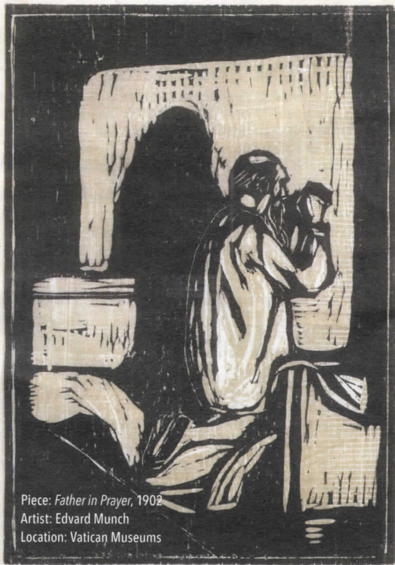
Piece: Father in Prayer , 1902 Artist: Edvard Munch Location: Vatican Museums