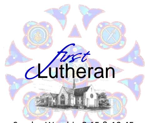
Sunday Worship 8:15 & 10:45 Sunday School 9:30