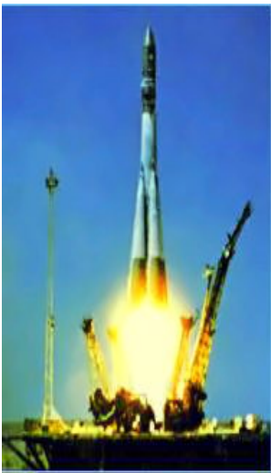
Ofishin Jakadancin ya dade

Minti 108 daga kaddamar da saukowa. Jirgin sama ne guda daya na orbital kewayen Duniya. Skimming sama-kowane yanayi a 327 km (Apogee) & 169 km (Peri-ji) mafi kankanta batu.