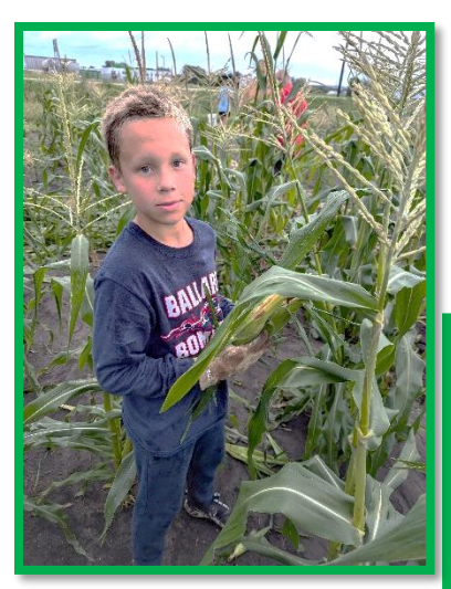
Thanks to everyone that helped donate their time and equipment to help pick sweet corn July 31st.