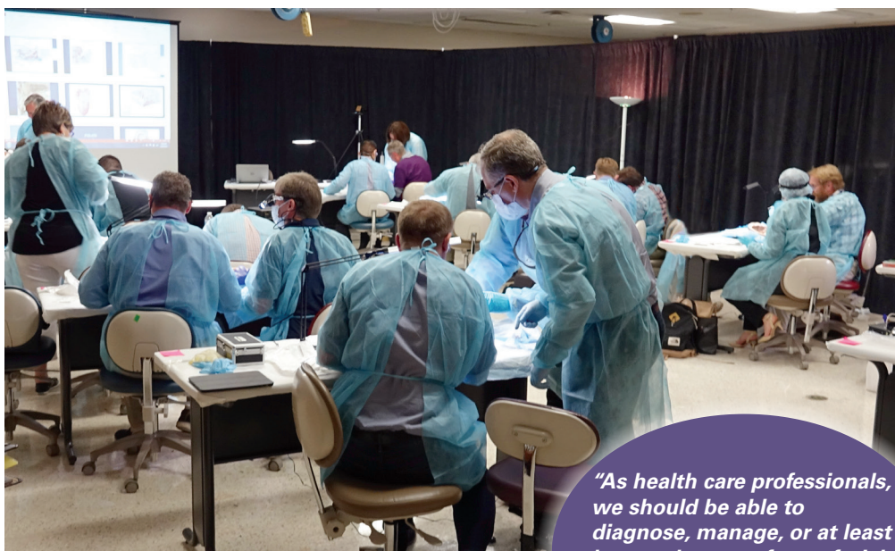
Participants work in two member teams to dissect the head, neck, and airway over a 2-day period.