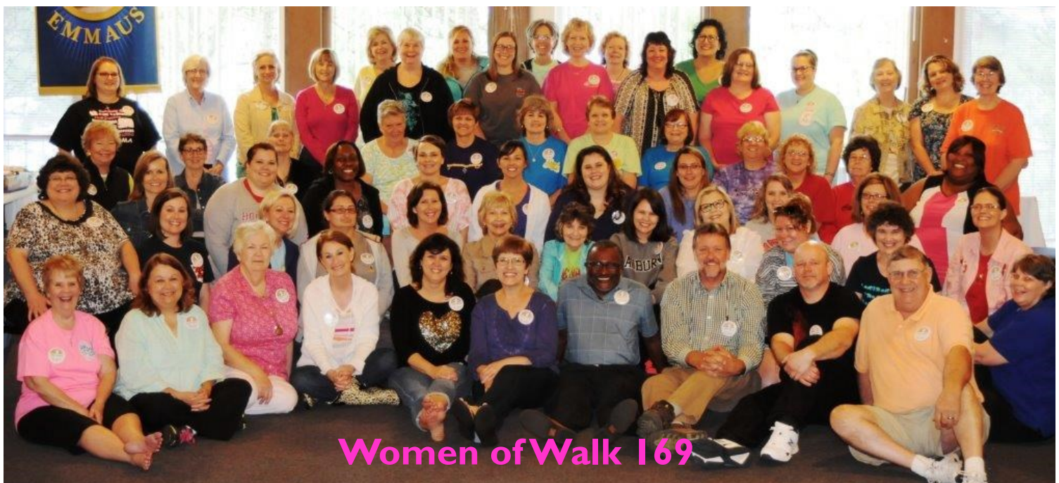
Women of Walk 169