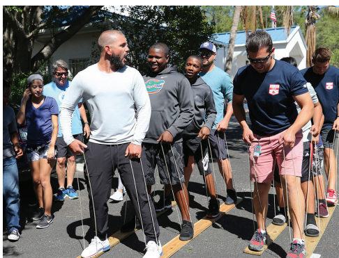
Boston Red Sox pitcher Robby Scott calls out instructions to fellow players and Youth Mentoring Program students.

AmazonSmile is a simple and automatic way for you to support Catholic Charities, Diocese of Venice, Inc. every time you shop, at no cost to you. When you shop at smile.amazon.com, you'll find the exact same low prices, vast selection and convenient shopping experience as Amazon.com, with the added bonus that Amazon will donate a portion of the purchase price to Catholic Charities!