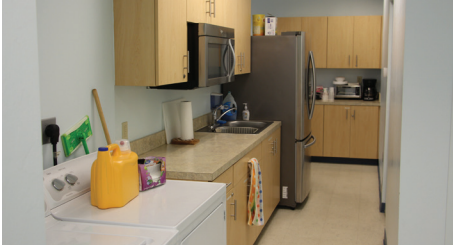
The Family Haven emergency shelter provides housing for two families.