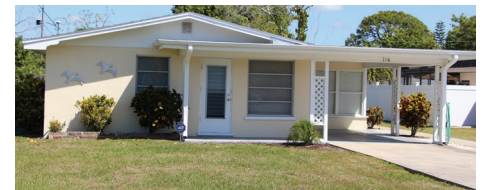
Transitional Housing is available to families who exit the emergency shelter.

The Catholic Charities Family Haven is supported in part by grants from Sarasota County Government, Gulf Coast Community Foundation, Jane's Trust Foundation, and Heron Creek Foundation. For more information, please call 941-564-8637.