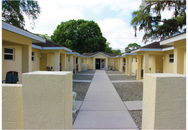
Casa San Jose is an eight-unit housing complex.

Bethesda House also provides an eight-unit permanent housing complex, Casa San Jose, for males living with HIV which offers wraparound services that empower residents to live independently and cope with their illness.