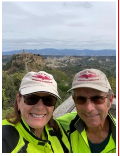
(Continued on page 7)

The secondary roads in towns were narrow and uneven. Although the GPS listed the driving route as a "road", often times it was more like an alley way with only enough room for one small car to pass through at a time. Sometimes there were one way signs regulating the flow of traffic in these narrow passageways, but most times there were no signs and you were on your own to make it