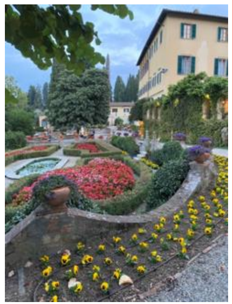
(Continued on page 8)

When you book your trip you get to choose what brand and model bike you want to ride. You must pick one primary choice and one secondary choice. Out of our 4 trips, we only got our secondary choice once. There are even "Harley Davidson only" trips available to book. The reason for Harley to be separate this is for safety. The size and ground clearance