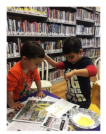
String Painting is FUN!