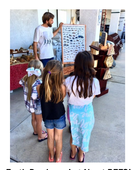
Earth Day Learning About BEES!