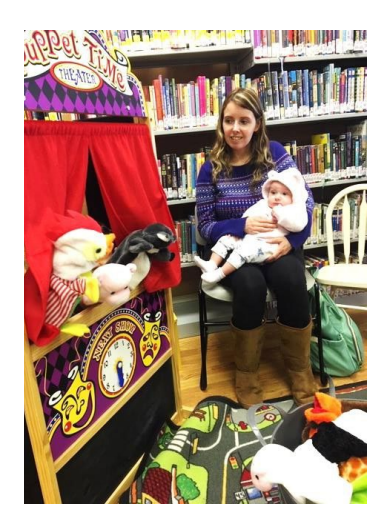
Older siblings put on a puppet show for their little sister!