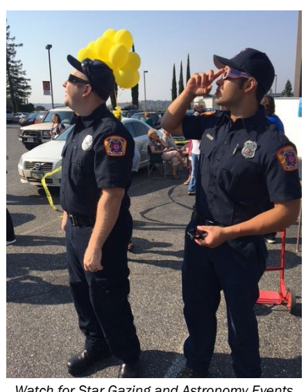
Watch for Star Gazing and Astronomy Events SUMMER/FALL 2019