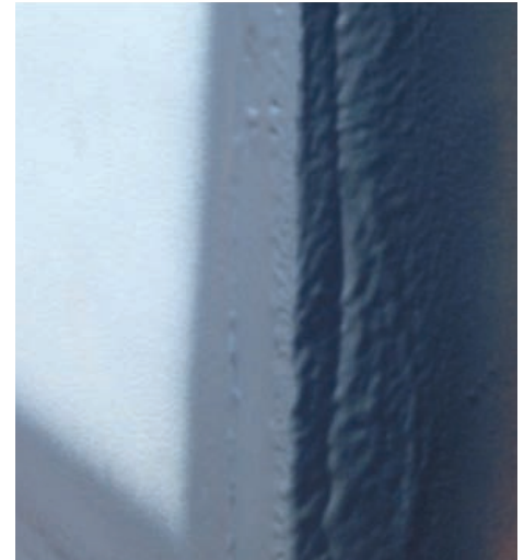
Table 2 provides a list of suggested sprayer tips for first time LIQUIDARMOR™ - CM Flashing and Sealing applicators. With application experience, installers typically develop their own preferences for specific sprayer tip size to reach product thickness and width targets. Variables such as actual spray pressure, spray nozzle orientation, application nozzle movement speed and application distance control many of the same parameters as the spray tip size such as product throughput and thickness.

Once a sprayer is selected for use with LIQUIDARMOR™ - CM Flashing and Sealant, select appropriate spray tips for the job. Generally, spray tip nomenclature consists of three numerical digits. The first digit communicates the relative spray width. The second and third digits provide information about the spray tips orifice size. A larger orifice size will deliver more material through the spray tip nozzle over a given time period. Such larger sized orifices work well around large opening and greater coverage widths like around penetrations or window rough openings. A smaller orifice size is recommended around small penetrations and board joints.