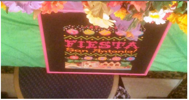
"Fiesta" stitched by Marsha Metz. Part of her program samples shown at The American Home & Garden Round Table last year.