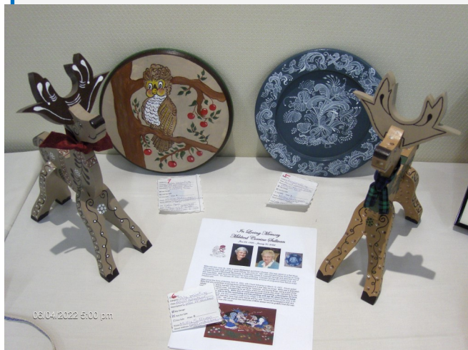
Left: Millie Sullivan's rosemaling display