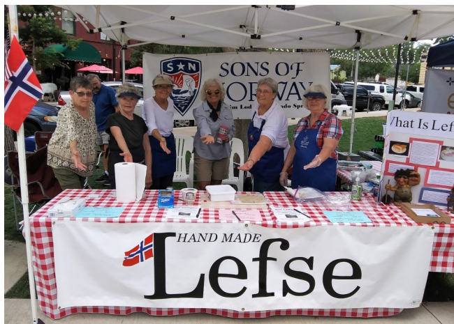
Lefse sellers on July 16, 2022 showing off their wares.