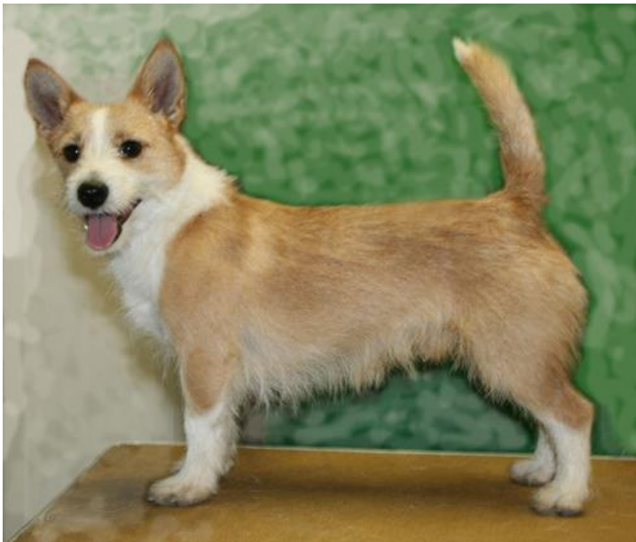
Ketka's Color Guard "Spinner"