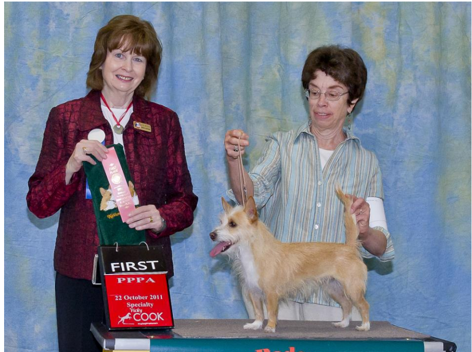
ARBA CH Aurora da Floresta - "Rory"