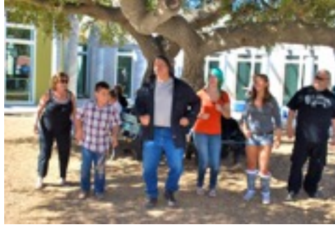
2014-2015 Council Members