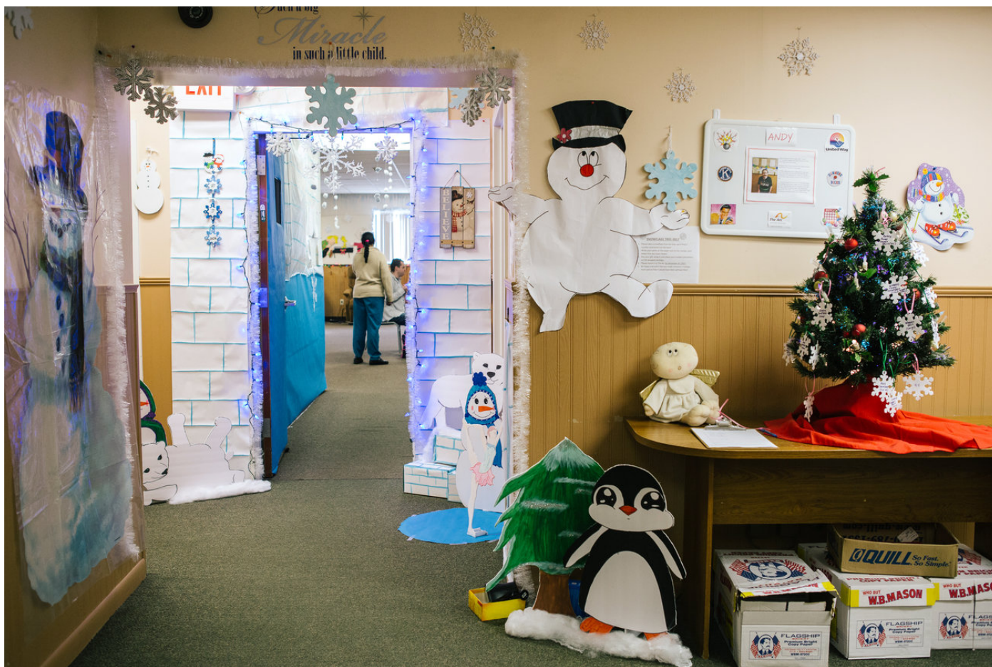
A view of the outside of the day program room.

There's debate among professionals about moments like this. Many argue that to do things with adults that are normally done with children is condescending and "infantilizing." Some argue that it stops adults from learning adult skills appropriate for their age.