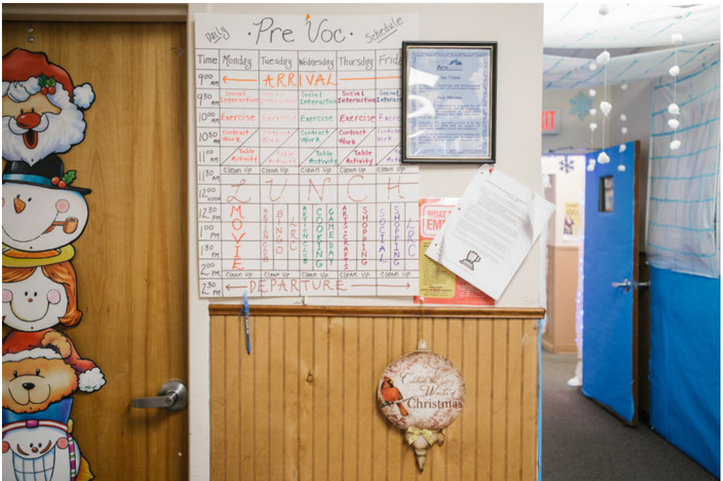
A calendar detailing the weekly schedule for adults with intellectual disabilities hangs in a room at the Arc Northeastern Pennsylvania.