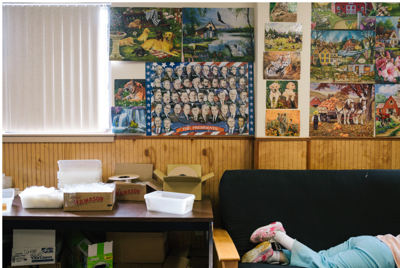
Completed jigsaw puzzles are displayed at the Arc Northeastern Pennsylvania.

"Developmental disability" is another commonly used term. And while this mostly refers to people with intellectual disabilities, it describes a larger group of people, including some without intellectual disabilities. People with cerebral palsy and autism, for example, are counted as having a developmental disability.