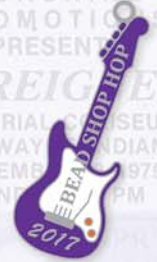
2017 BSH Charm