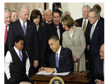
Signing ObamaCare into Law