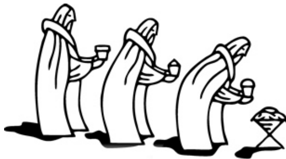
The Magi bring gifts