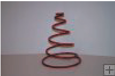
Seat Spring 354670R2 Correct height and tension Fits H ,M ,Super H, M ,MTA.