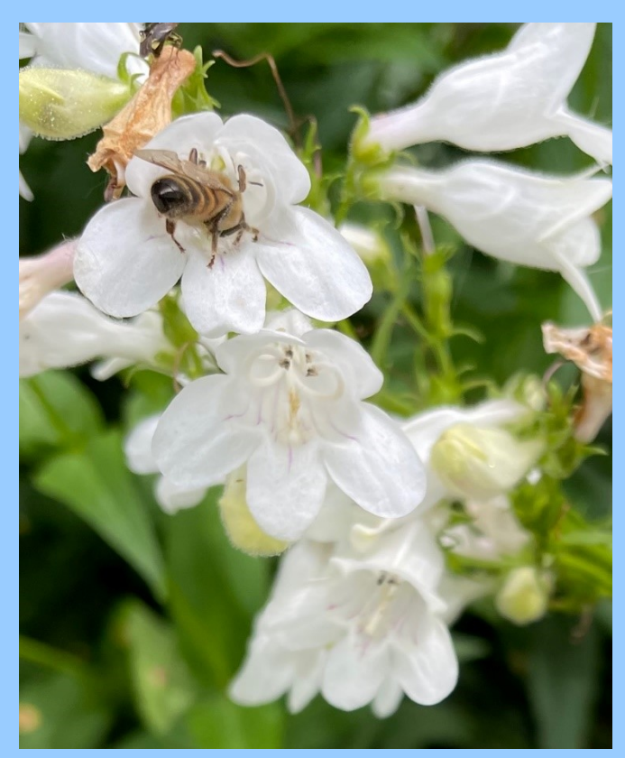
June 5 – Penstemon digitalis, Berryton, KS – C. Burkhead