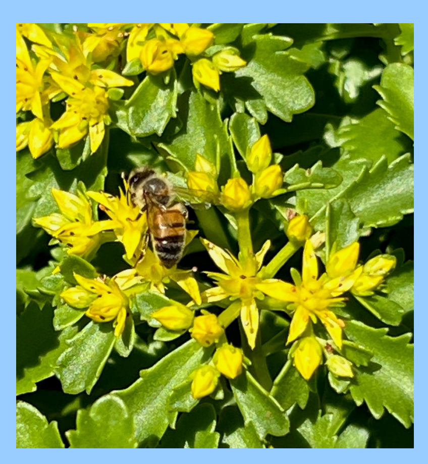
June 2 – Sedum, Auburn, KS