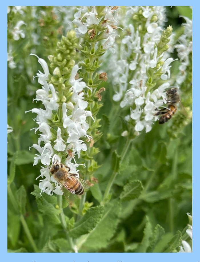
May 23 – Meadow Sage Salvia 'Snow Hill', Berryton, KS