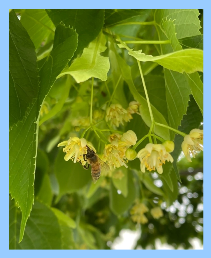
June 4 – Littleleaf Linden, Lawrence, KS – C. Burkhead