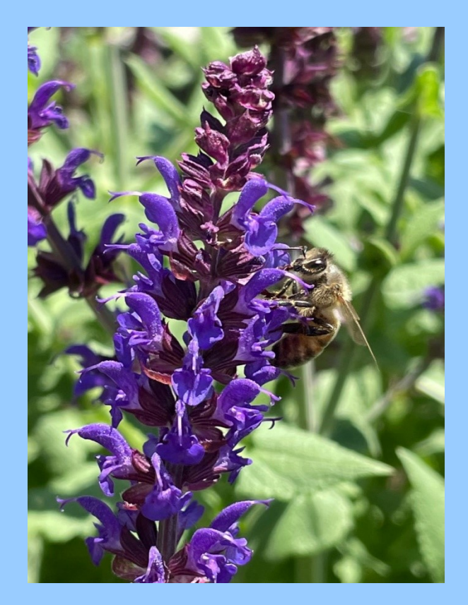
May 27 – Salvia 'May Night', Berryton, KS