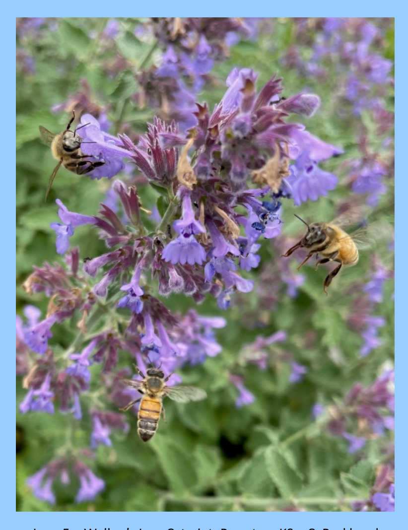
June 5 – Walker's Low Catmint, Berryton, KS – C. Burkhead