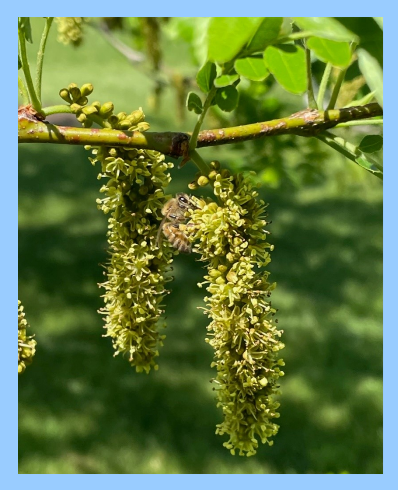
May 18 – Shademaster Honeylocust, Berryton, KS