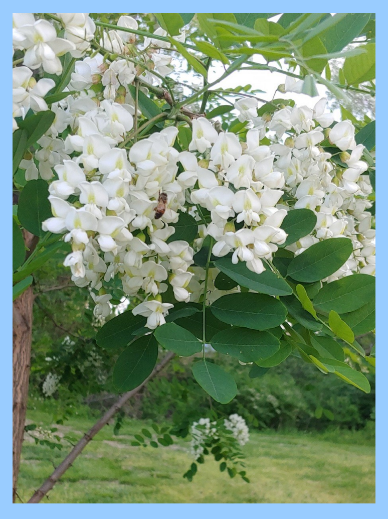
May 11- Black Locust, Olathe, KS