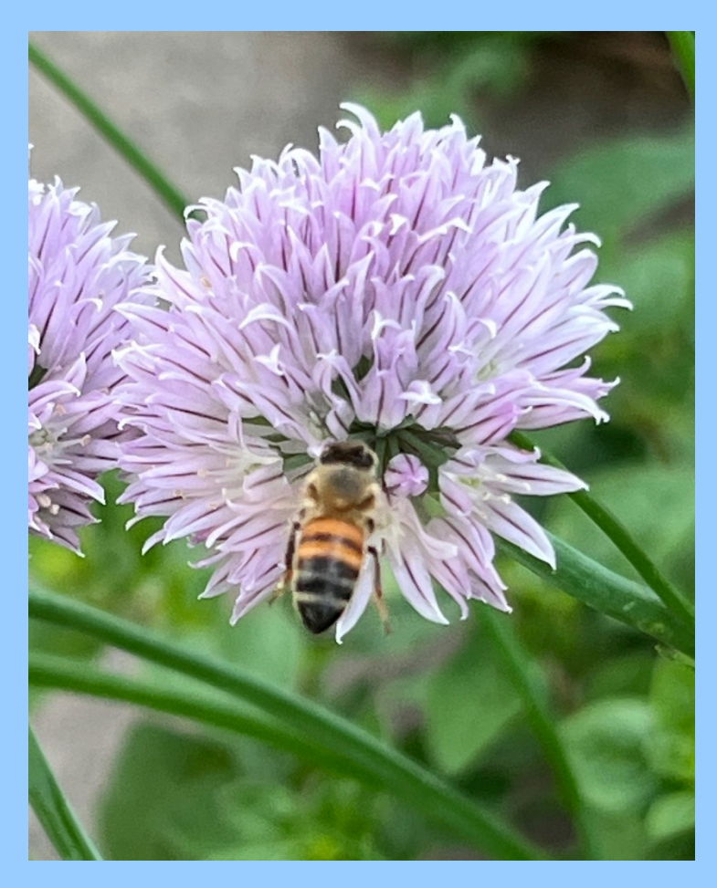
May 13 – Chives, Auburn, KS