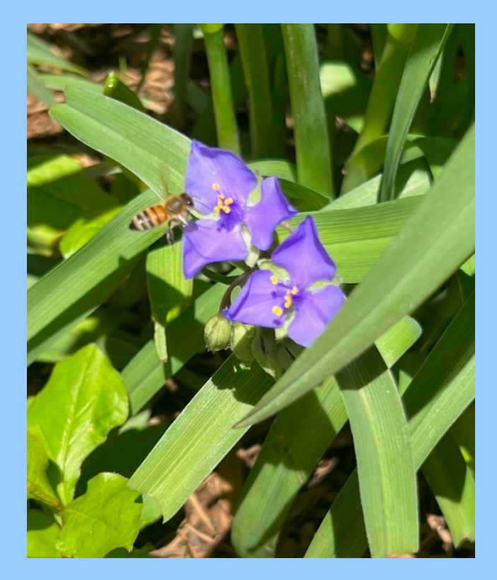
May 27 – Spiderwort, Auburn, KS