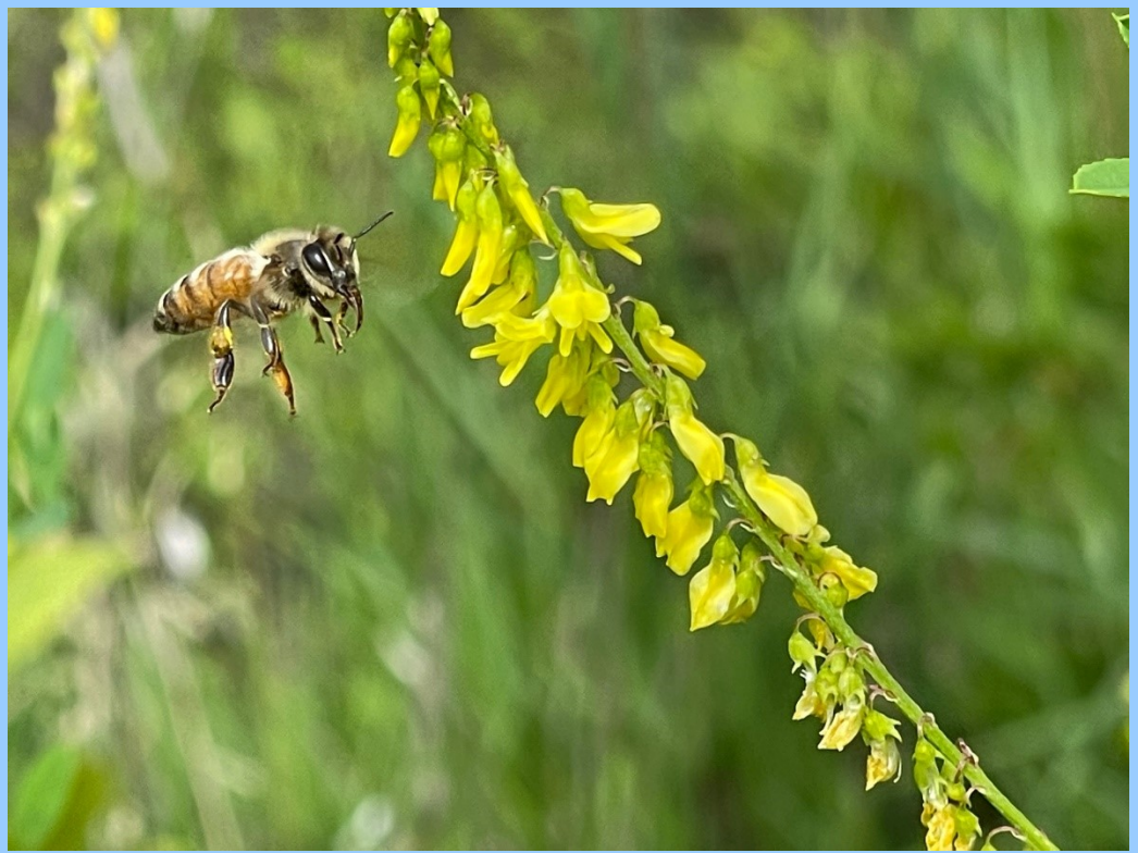
June 6 – Yellow Sweet Clover, Berryton, KS – C. Burkhead