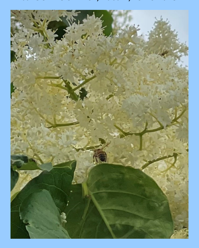
June 4 – Japanese Lilac Tree, Lawrence, KS – C. Burkhead