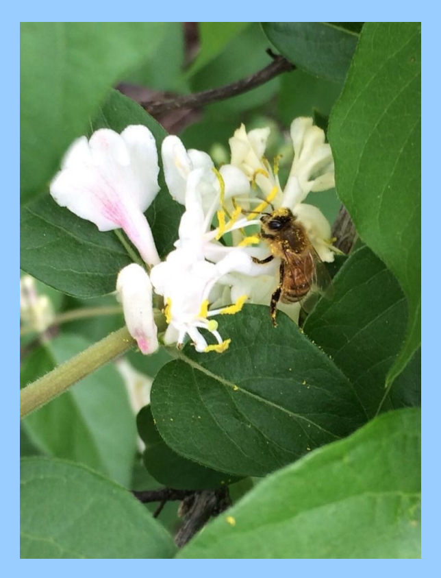
May 2 - Asian Honeysuckle, Berryton, KS