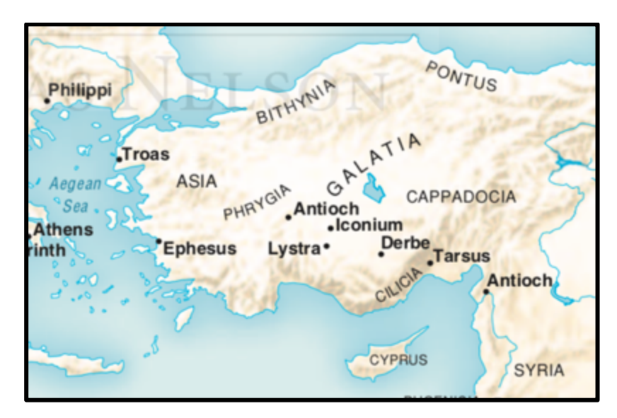
Nelson's Bible Maps