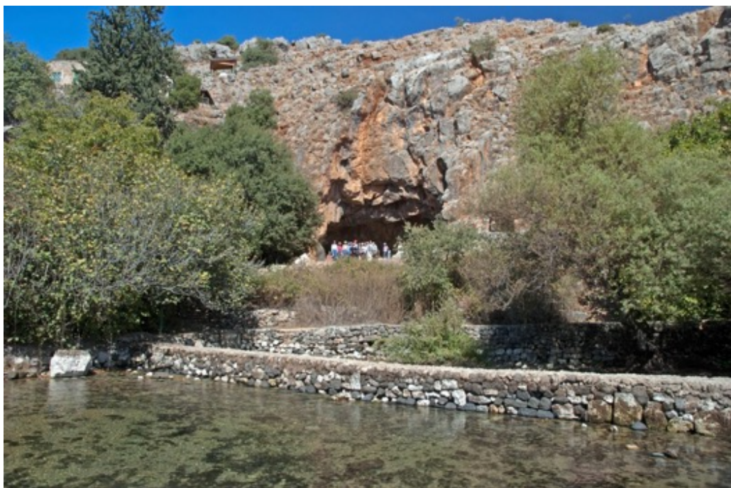
Caesarea Philippi—Gates of Hell