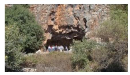
Church built on rock at Caesarea Philippi (Gentile place)

"Nowhere in the New Testament are the privileges and responsibilities of Israel applied to the Christian community as freely as in 1 Peter." ( The New Testament Speaks , p. 337)