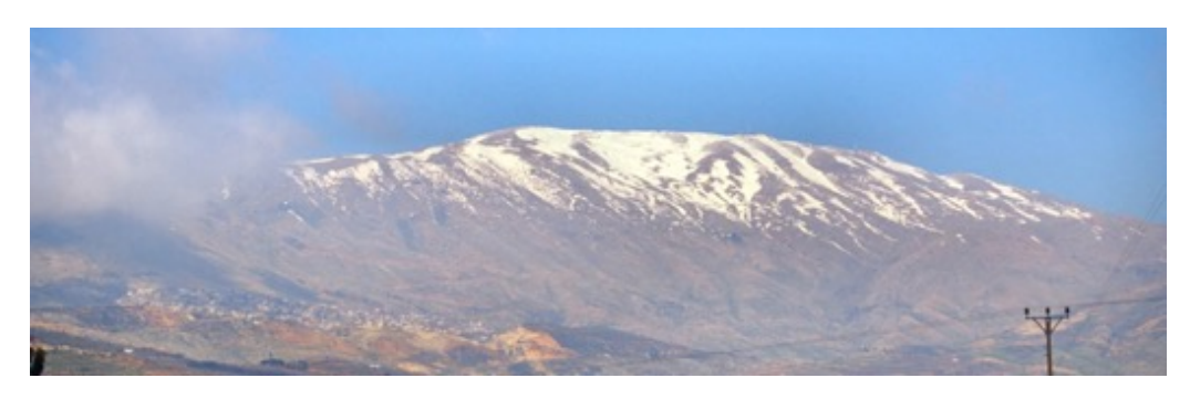
Mt Hermon, Israel

The cost of Living for God in a World without the True God.