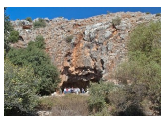
On this rock, I will build my church and the gates of Hell shall not prevail against it.