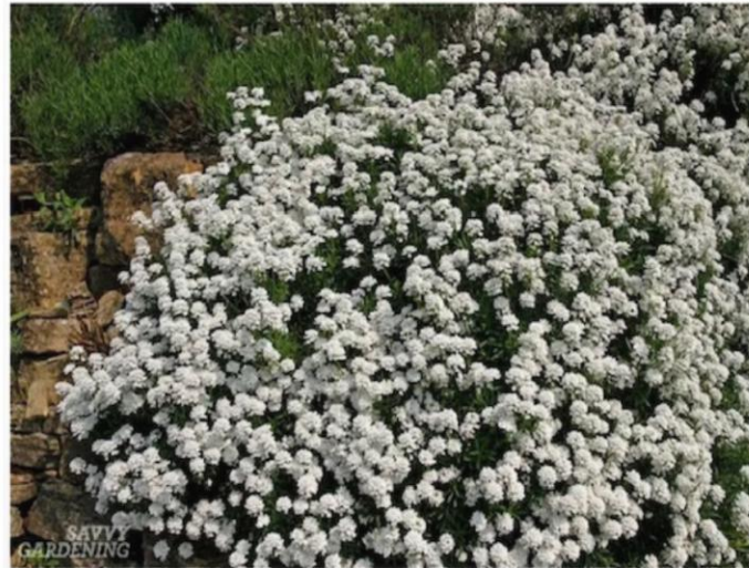
Candytuft produces white flowers in the spring, atop evergreen foliage.

Once an exceedingly popular garden plant, candytuft seems to have fallen out of favor in recent years, for some unknown reason. What's not to love about an evergreen groundcover that spreads relatively fast, is covered with clusters of white flowers, is adored by pollinators, and is hardy down to -30 degrees and perhaps beyond? The only fuss-factor with Candytuft is its desire for well-drained soils and full sun. Shearing the plant back after bloom keeps it even more compact, but the practice isn't necessary.