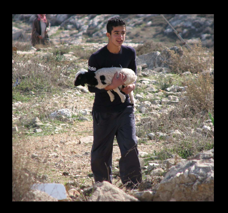
A shepherd looks after his sheep, and each little lamb is important.