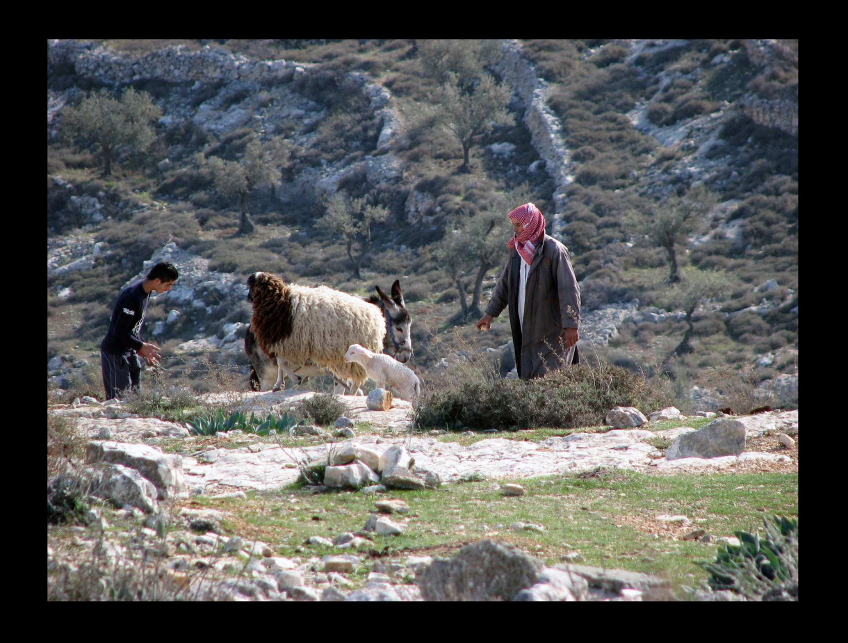
Two shepherds, with their sheep, outside of Bethlehem and located just a few miles from Jerusalm.