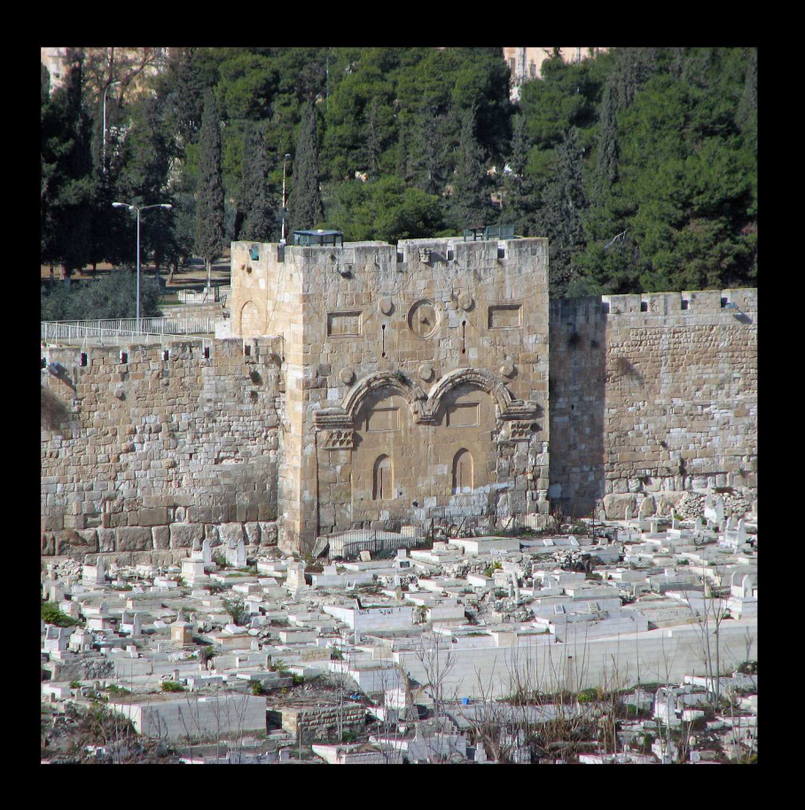
The Golden Gate!