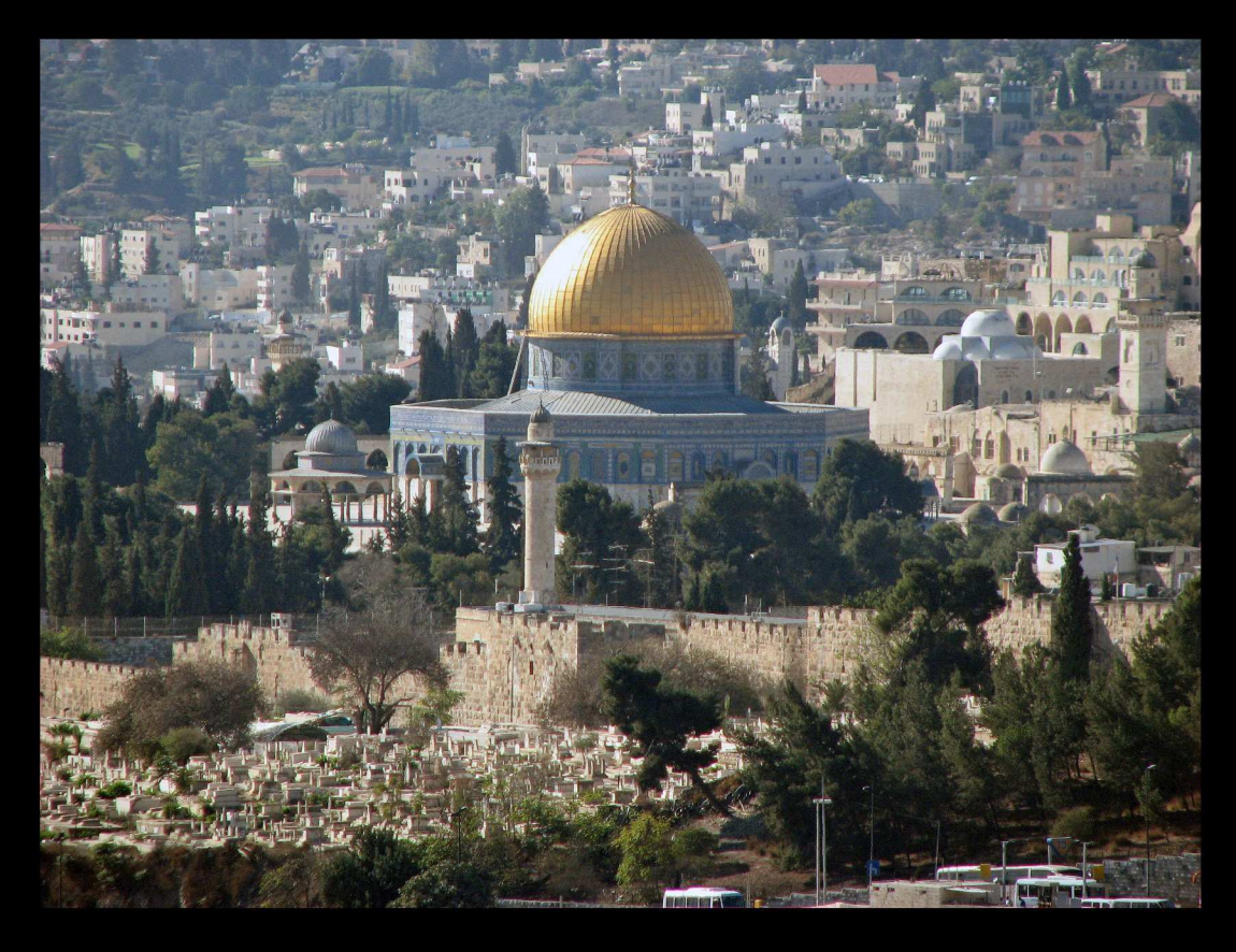
Jerusalem was proclaimed the capital of Israel by King David in 996 BC

This city remains the focal point of Judaism and Christianity, and is also considered Holy by Islam.