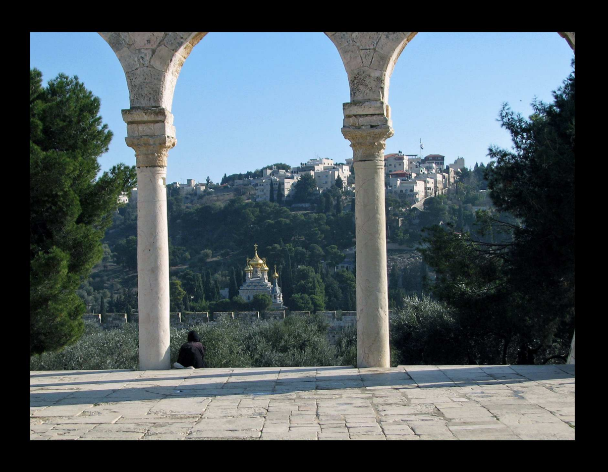
Looking from the Dome of the Rock at The Mount of Olives, across the Kidron Valley, with the Russian Church in the middle of the picture.