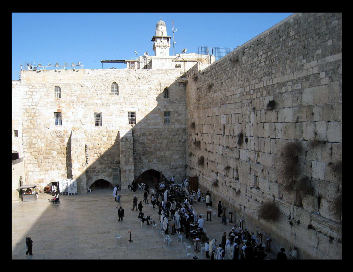
A view of the Western Wall, which attracts people from all over the world to come and pray at this wall. This is the western retaining wall that supported the huge plaza which Herod used when he built the Temple.