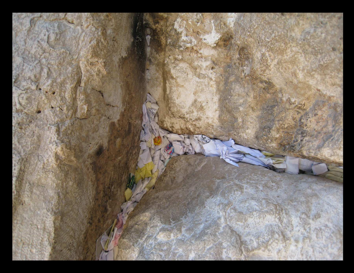
Many people write their prayers on a piece of paper and stick them in the cracks in the Western Wall. The Temple Mount was the greatest bulding project in the Roman world.