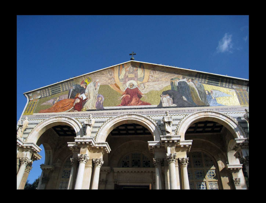
The Basilica of Agony at Gethsemane. (The Church of All Nations)