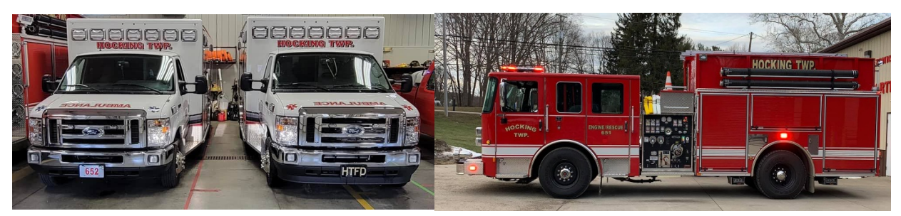
Medic/Squad 651 & 652