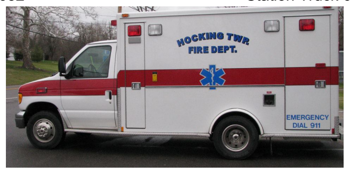
Reserve Squad 653