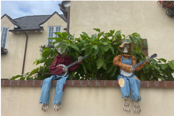
Monte Vista St.