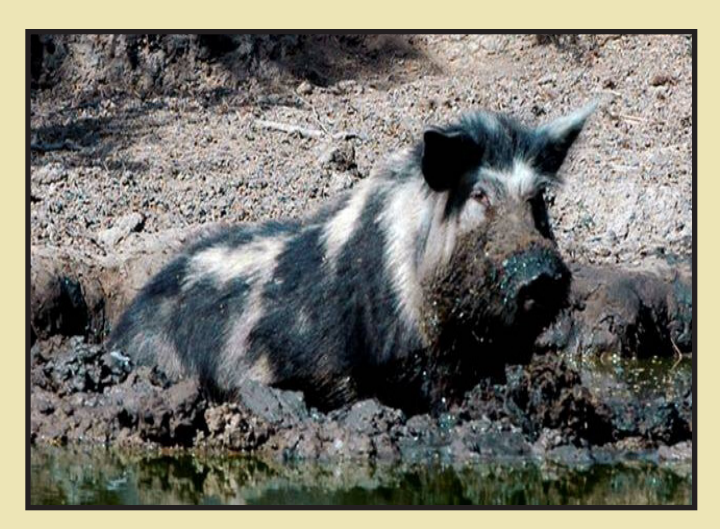
Figure 1. Feral hog wallowing along a water source.

Feral hogs impact water quality largely due to behavior related to their physiology. Because feral hogs do not have sweat glands, they commonly wallow in and near water sources to keep cool (Figure 1). This process covers their skin with mud that they rub off on trees and utility poles to remove external parasites.