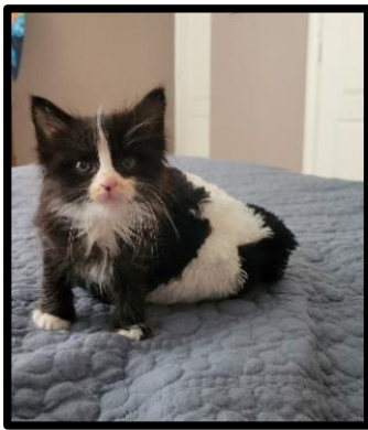
“Mew” (Breed: Maine Coon)