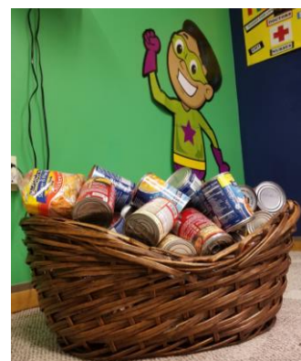
Soup Bowl collection

The next Guild meeting is on March 21 and all St. Paul's women are invited.