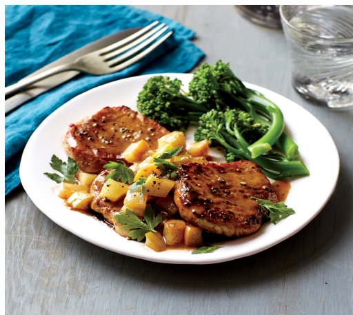
Pork Chops, Chunky Applesauce