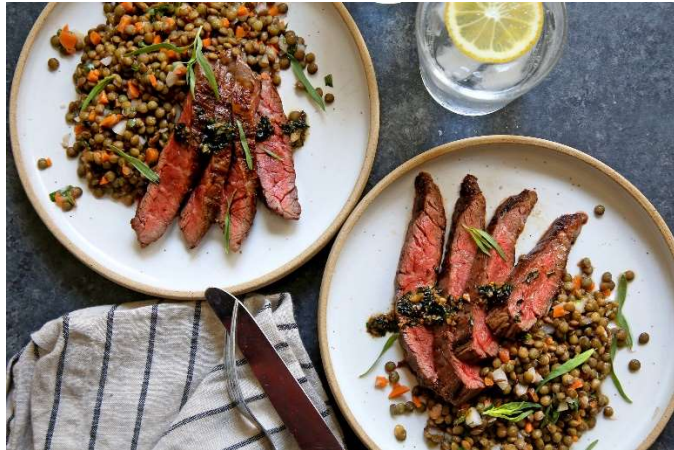
Flank Steak Over Lentils