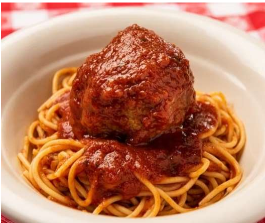
Spaghetti Baseball Meatball