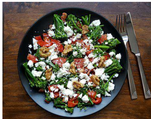
Greek Broccoli Salad