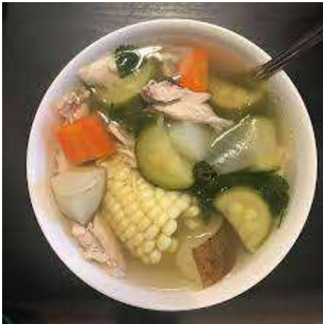
Caldo De Pollo