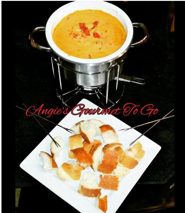
21. Fondue Cheese Dip