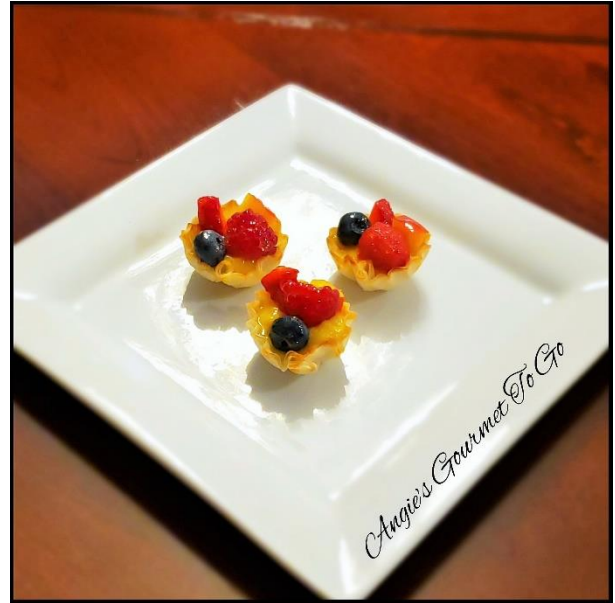
38. Mini Fresh Fruit Tarts