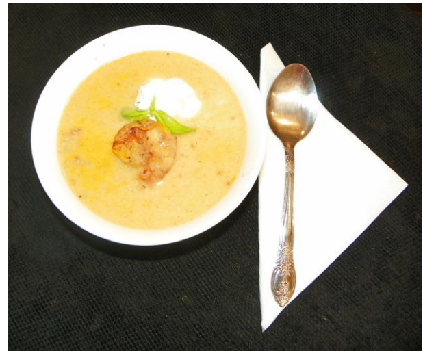
27. Seafood bisque with shrimp and crawfish, topped with a dollop of crème fresh and garnished with fresh sweet basil