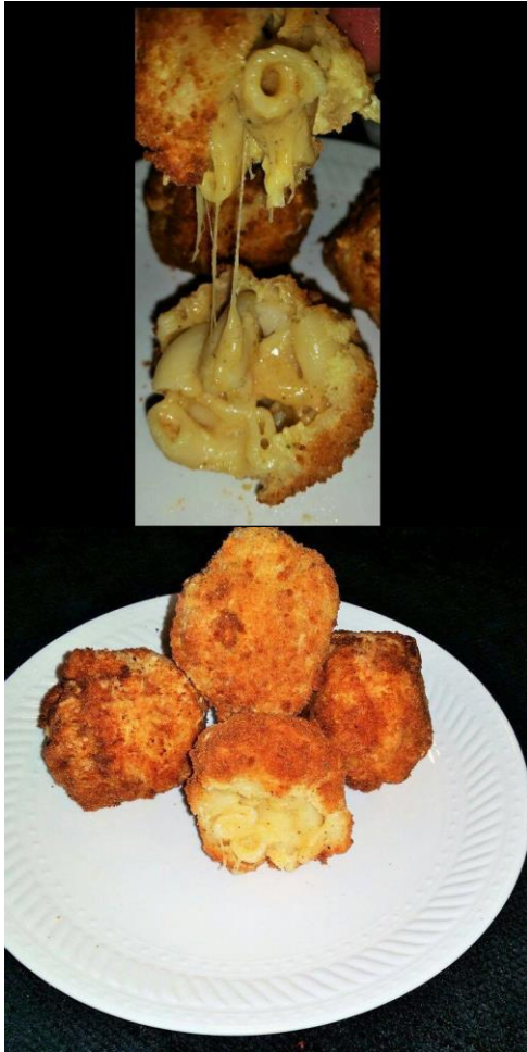
24. Fried Macaroni & Cheese Balls