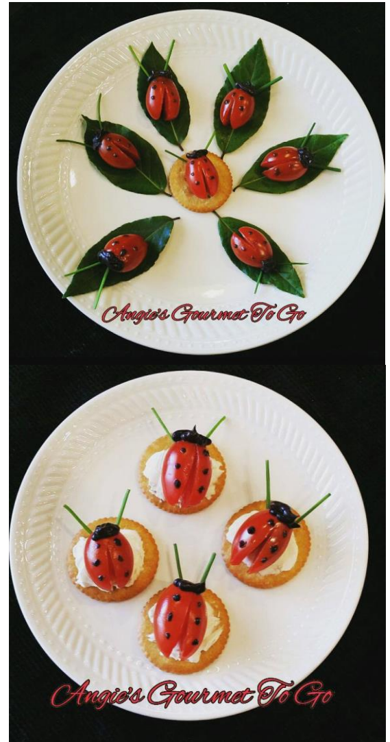
23. Cherry Tomato Lady bugs