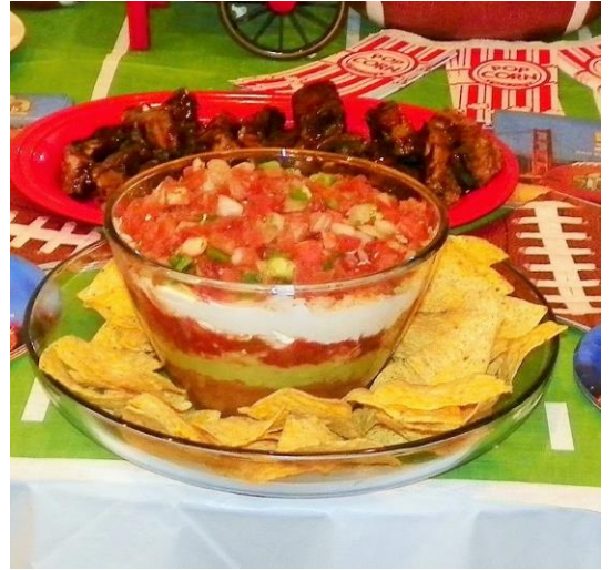
15. 7 layer Dip