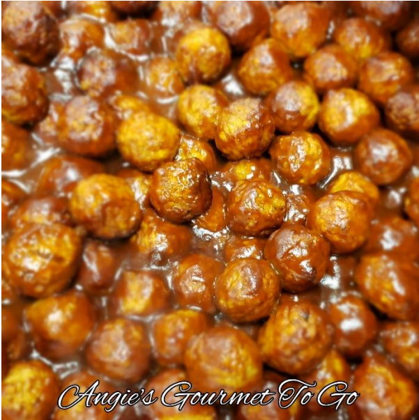
36. BBQ Glazed meatballs