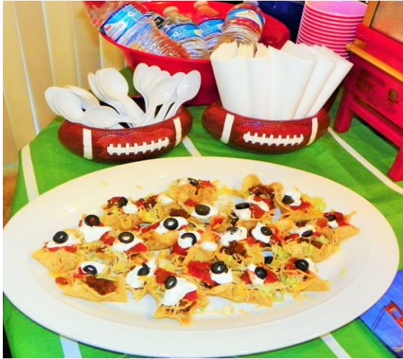
13. Mini Taco Bowls