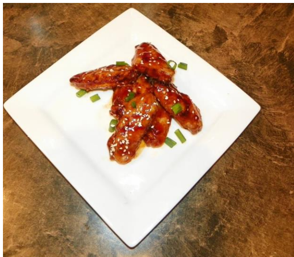
14. Teriyaki Glazed Chicken wings topped with toasted sesame seeds and fresh chives