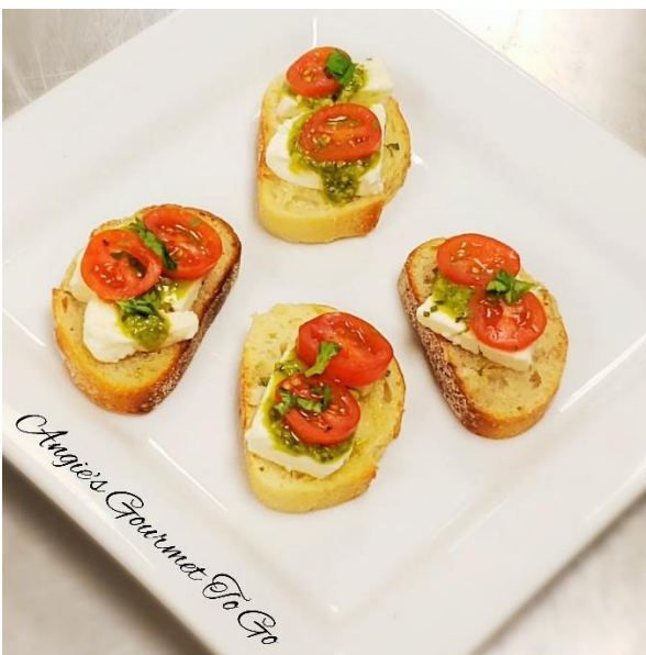
37. Mini Mozzarella Bruschetta Bites