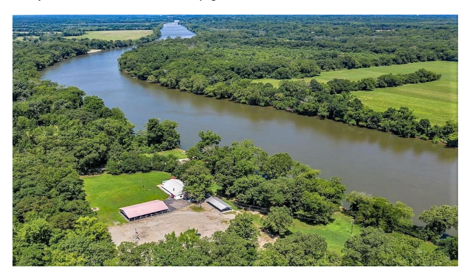
Family & Friends Picnic continued from page 3