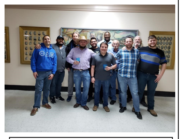
A great time was had at our Bourbon and Cigar event. We confirmed 2 petitions for our upcoming Reunion. If you weren't able to join us this time we hope you will be able to make it in the future.

Please join us for our One Day Spring Reunion